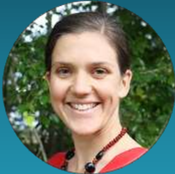
Kim Mallee Community Power Agency