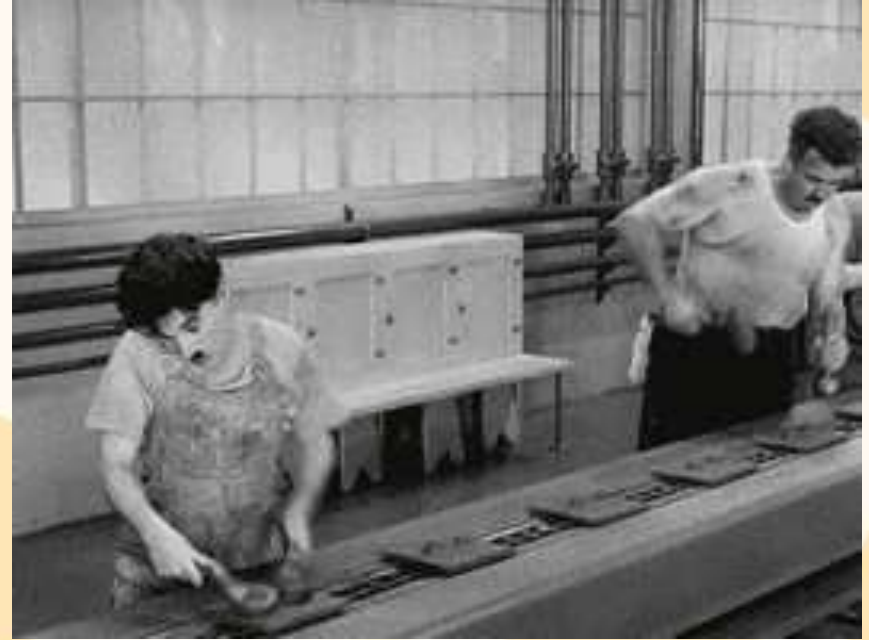
Charlie Chaplin, Modern Times