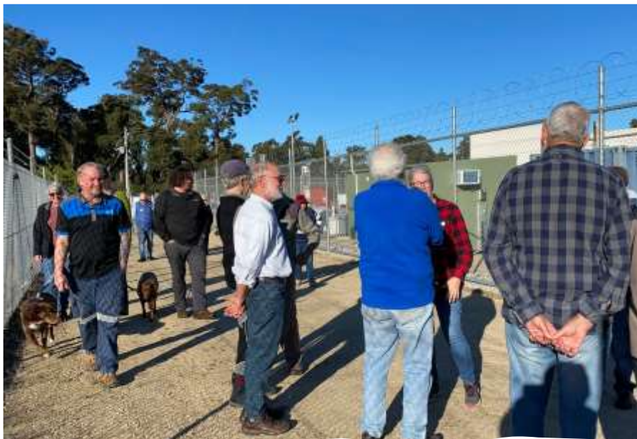
The Big Battery commissioned 28 May 2021